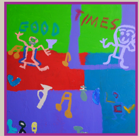
2020 - Al Young