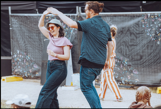
Scrim for temp fencing panels