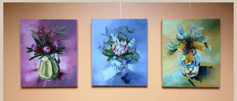
2018 - Sally Glover