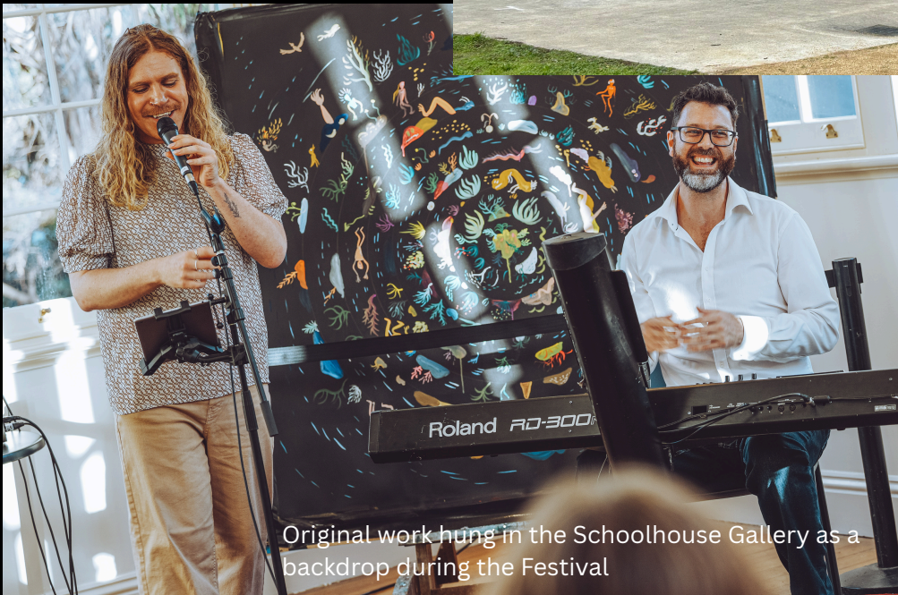
Original work hung in the Schoolhouse Gallery as a backdrop during the Festival